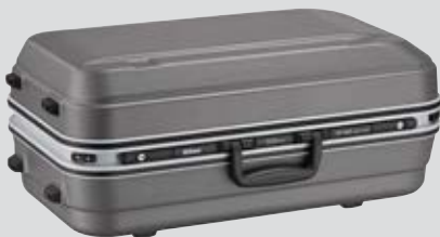
Lens Case CT-505 (included)